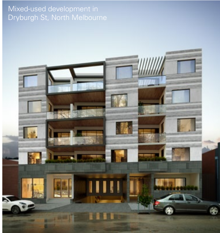
Mixed-used development in Dryburgh St, North Melbourne