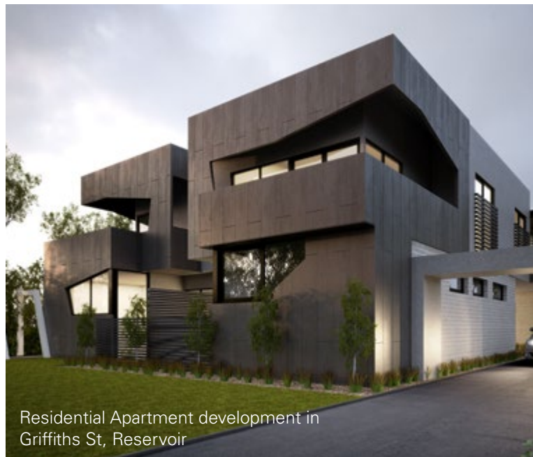
Residential Apartment development in Griffiths St, Reservoir

Address 281 Lygon Street East Brunswick VIC 3057