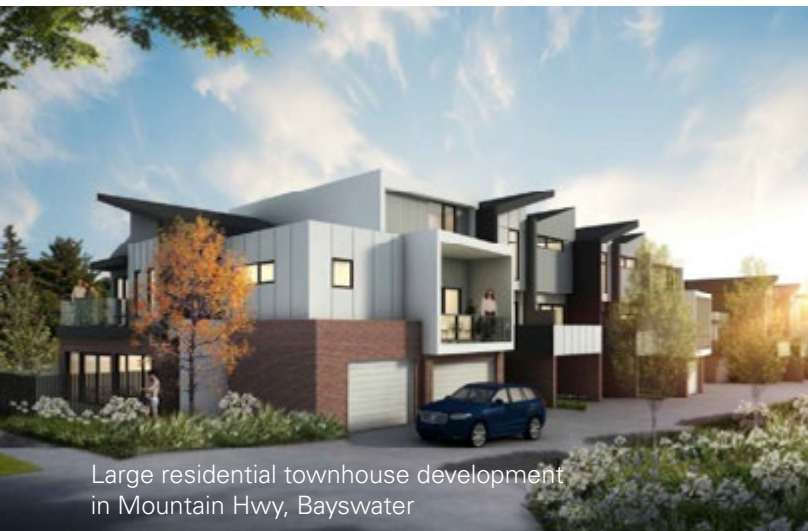
Large residential townhouse development in Mountain Hwy, Bayswater