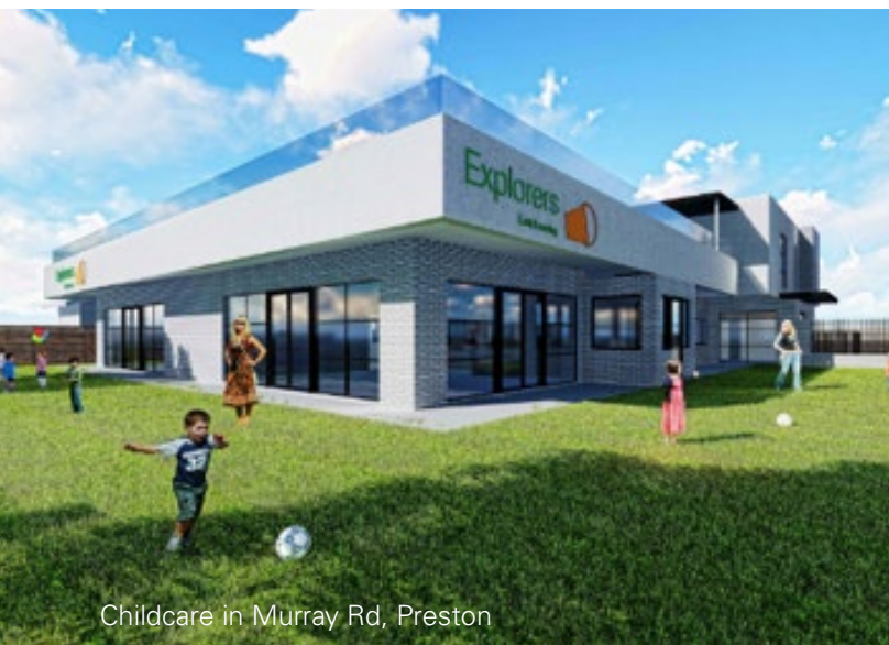
Childcare in Murray Rd, Preston