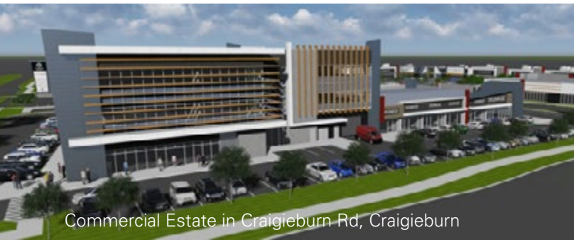
Commercial Estate in Craigieburn Rd, Craigieburn