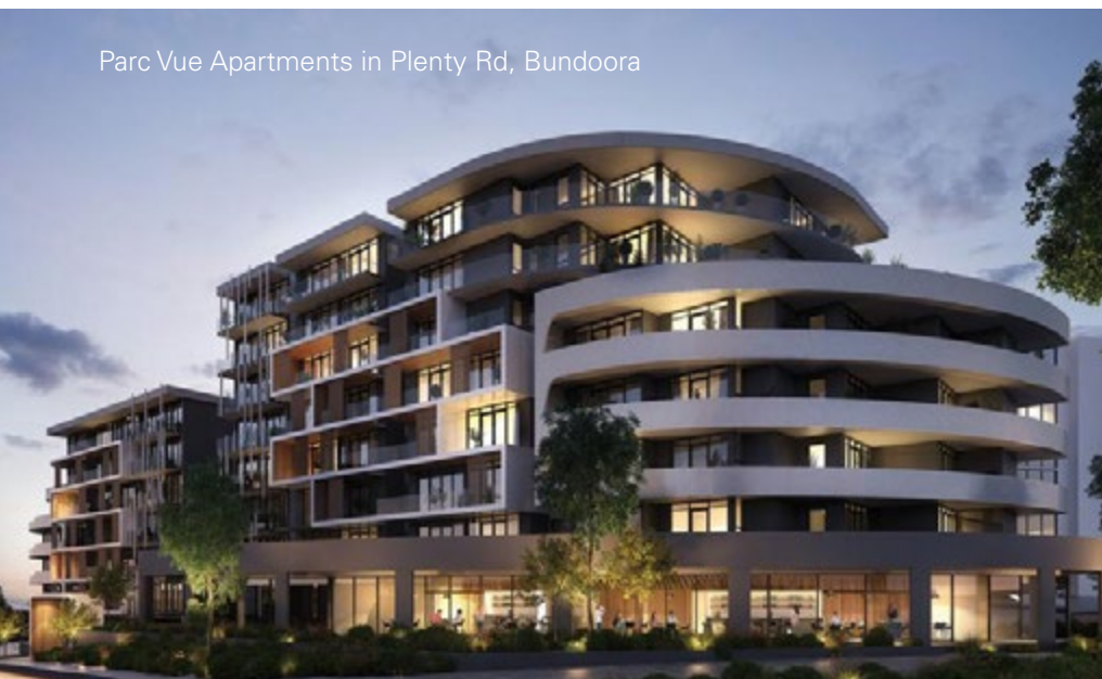
Parc Vue Apartments in Plenty Rd, Bundoora

Address 281 Lygon Street East Brunswick VIC 3057